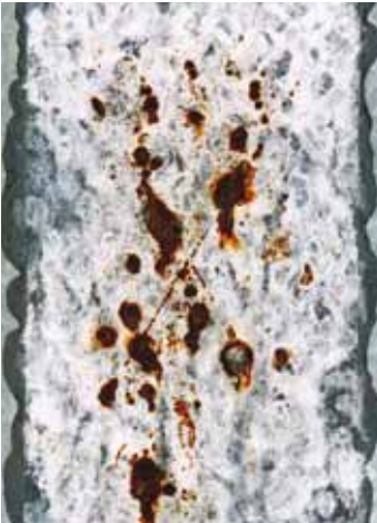
Z275 galvanised steel @ 240 hours of salt spray testing.