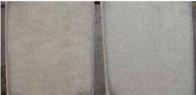
ZINCALUME® Steel AZ150 Washed Panels – Exposed for 21 years

A. Compared to ZINCALUME® AZ150 steel, a Zinc Aluminium coating of AZ70 will reduce the life of the product by more than 50% (or half the life).