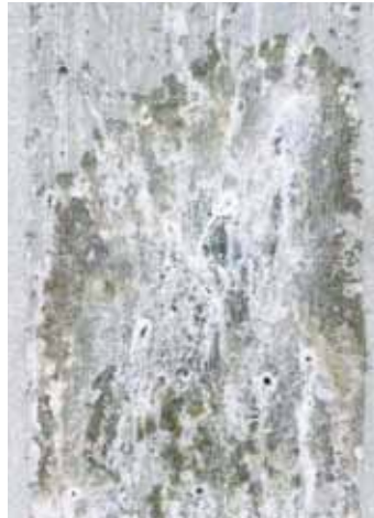
ZINCALUME® steel @ 2000 hours of salt spray testing.