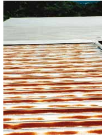
Galvanised steel, foreground, and ZINCALUME® steel after 20 years of natural exposure.