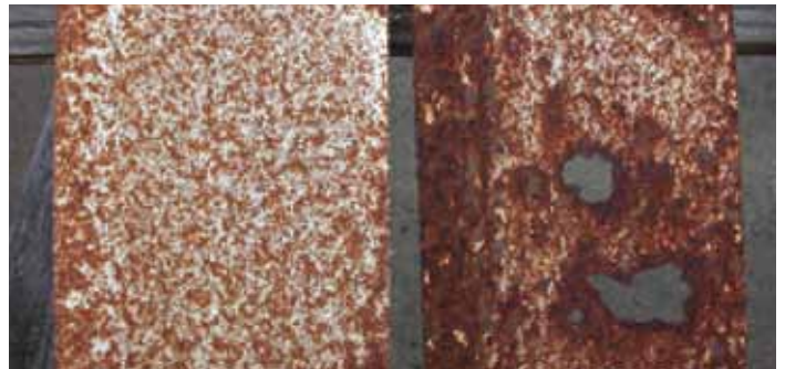
Galvanised Steel Z300 Washed Panels – Exposed for 21 years